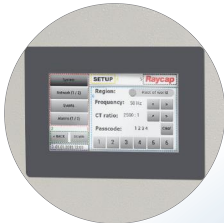
Rayvoss AD Protection Monitoring